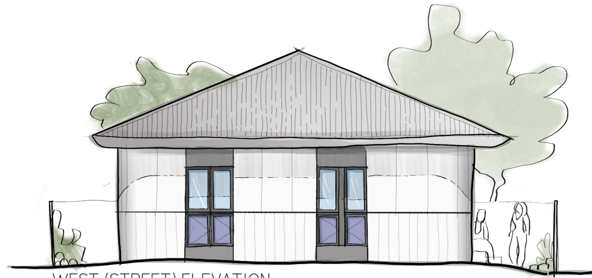
WEST (STREET) ELEVATION 1:100 @ A3