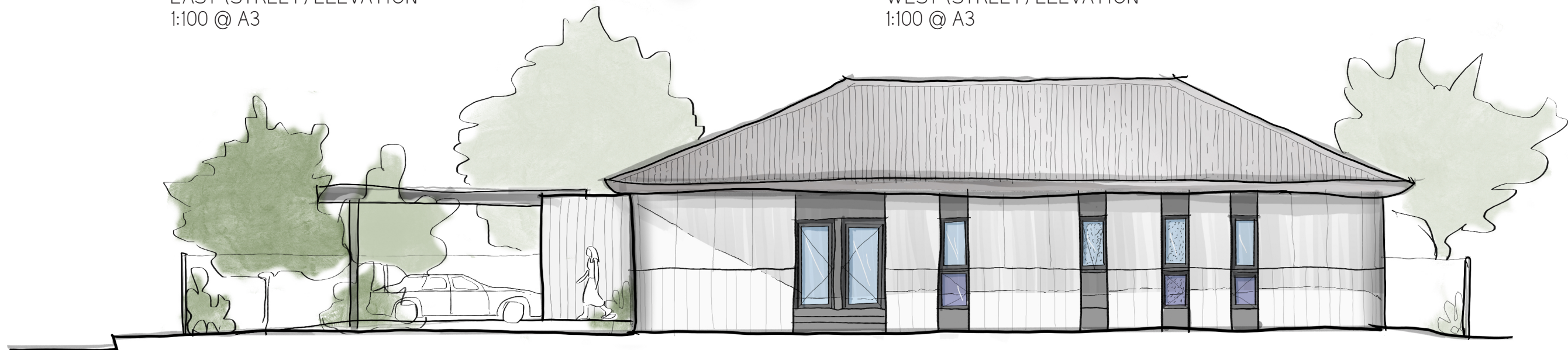
SOUTH ELEVATION 1:100 @ A3