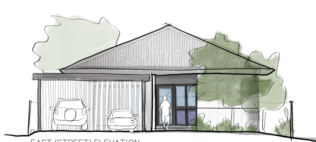
EAST (STREET) ELEVATION 1:100 @ A3